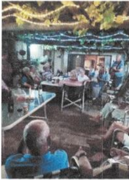
Left. Meet and Greet at Northlands

Another very successful poet's gathering at the Boyup Brook Country Music Festival