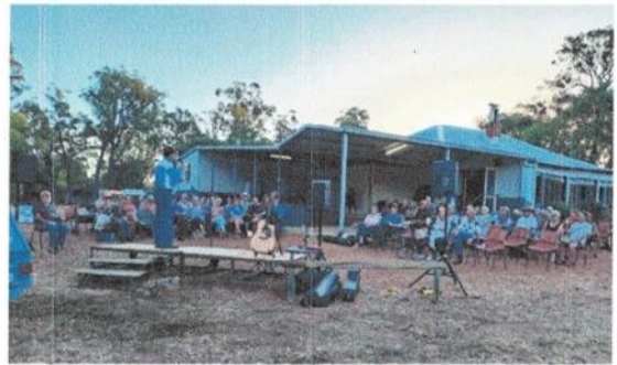
New event at Boyup Brook Golf Club